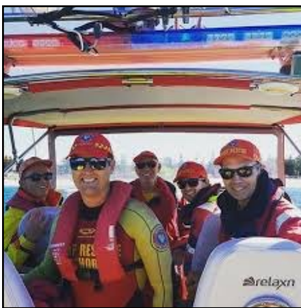
Full house ... all smiles! Summer in Randwick!

For those who were not able to attend Surf Rescue 30's annual 2015/16 presentation awards and who attained their proficiencies contact Karl to make arrangements to collect your award. This year's award included a fully sealable and SR30 logo'd waterproof backpack and an embroidered beach towel - all thanks to young Nixy!