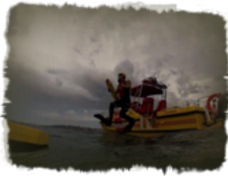
Top: Sitting off Wedding Cake Bottom: Crew training off a stormy Coogee